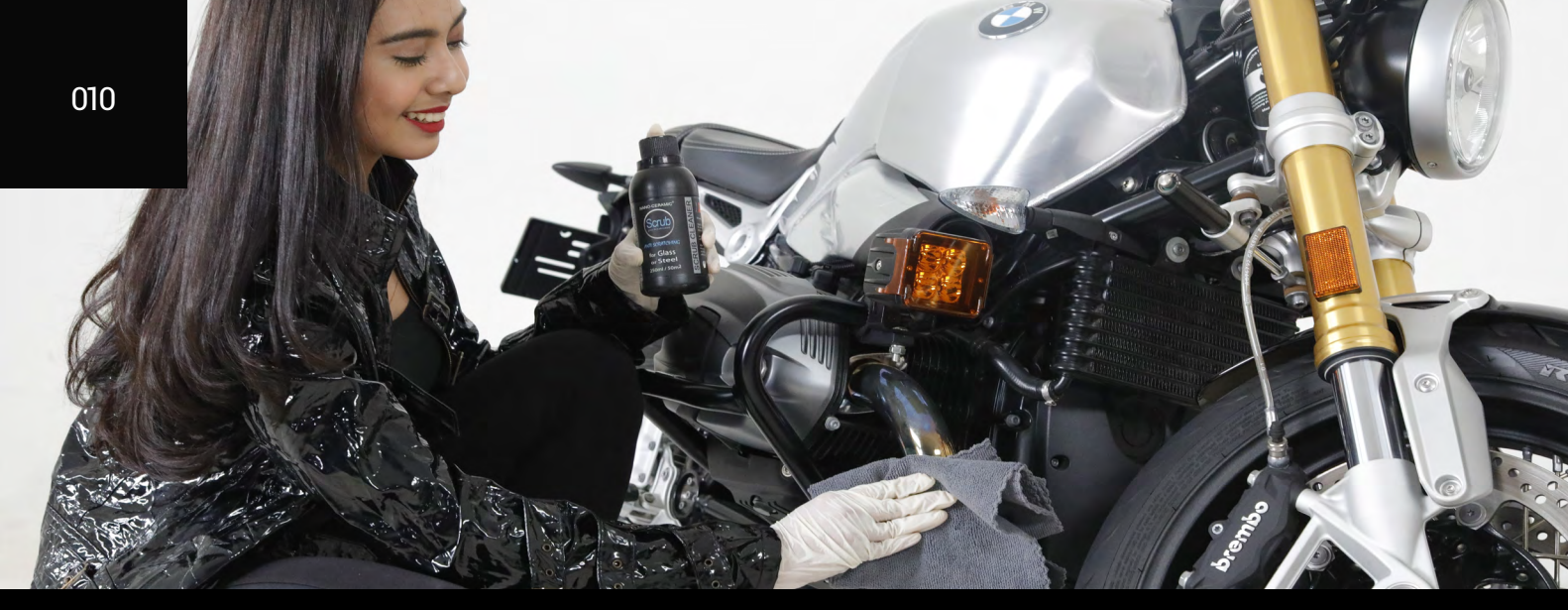
Scrub cleaner is the safe way to remove stubborn contamination while keeping the surface intact.