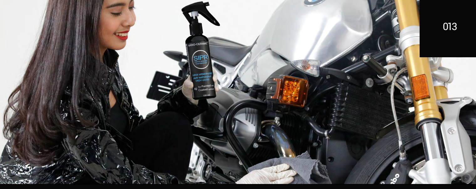
A hydrophobic, glossy ceramic sealer that protects coated and uncoated motorcycles.