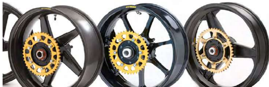
Protect aluminum and chrome rims from brake dust buildup.

NANO-CERAMIC is more than 4 times stronger than factory paint finishes and can absorb damage that would otherwise affect the appearance and integrity of your paint. This extremely durable ceramic coating reduces swirl marks and micro-scratches while protecting and preserving factory paint.